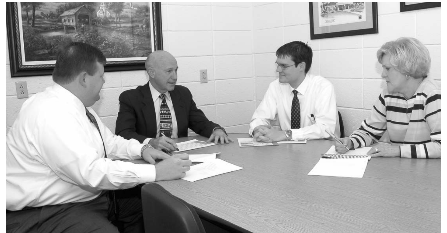
The Institutional Advancement office staff discusses the upcoming "Just Imagine" campaign at a staff meeting.

A long-time friend of the college, BCF's new vice president for institutional advancement chats with the editor of Echoes about his new found responsibilities as a member of the college's administration and what it's like to now be on the inside at BCF.